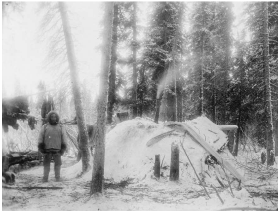
Campsite on the search expedition for the Lost Patrol of Inspector Fitzgerald.